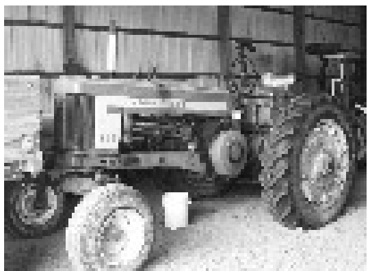
520 J. D. wide front, power steering, new tires 13/6/12/36 serial # 5206294