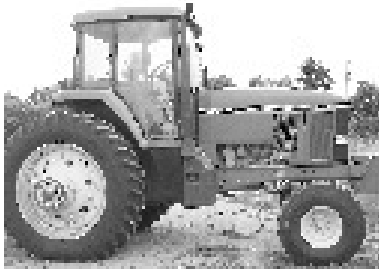
7800 J. D. tractor w/2200 hours, 18-4/42 tires w/duals serial # R W 7800H004077, bought