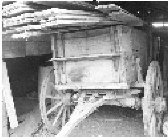
High Wheel John Deere 4 spoke Wagon