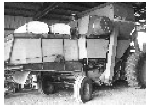
Gleaner Allis Chalmers L-2 combine 6-row header, 644 John Deere corn head Gleaner combine, 20' platform, serial #LKS15714H6