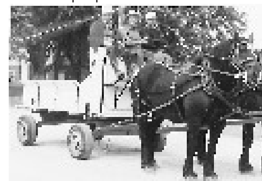
4-Wheel Rubber tire show horse wagon