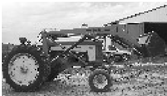
630 J. D. wide front, power steering, new tires 13-6-38 serial #6313607