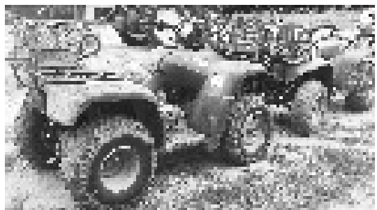
2003 Honda 4-wheel fourtrax 300 w/1934 miles 1989 Honda Ranches E5

White Chevy Tilt Cab 60 20' box w/hoist & stock rack, tag axle