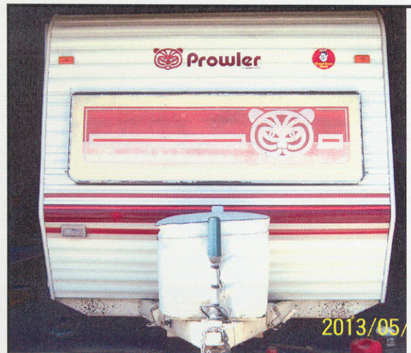
28' Prowler by Fleetwood camper, fully equipped, sleeps 6 w/ bumper hitch '92 Grey Buick w/92,000 miles, new tires, excellent condition