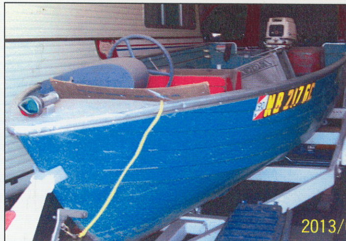
15' Crest Liner fishing boat, 18 hp. Johnson motor w/trailer '93 Chevy Scottsdale 10 pickup on propane w/topper