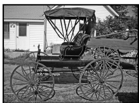
Doctor's buggy (nice)